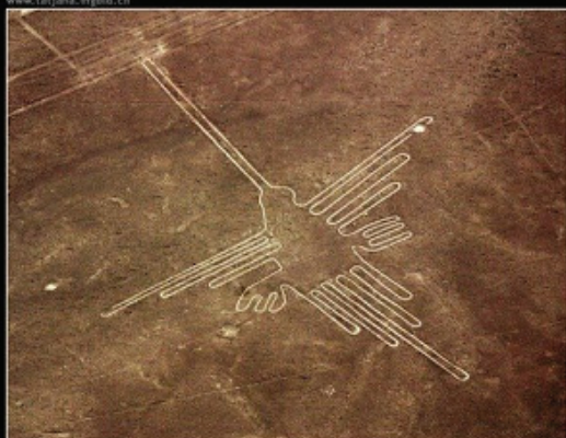
Hummingbird, Nazca (Peru)

14-21 N:Hummingbird Earth Drawing D:500 P/S:Early American A: Unknown Pa: Unknown L:Nasca, Peru